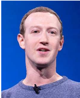
Mark Zuckerberg Meta

"Metaverse isn't a thing a company builds. It's the next chapter of the internet overall."