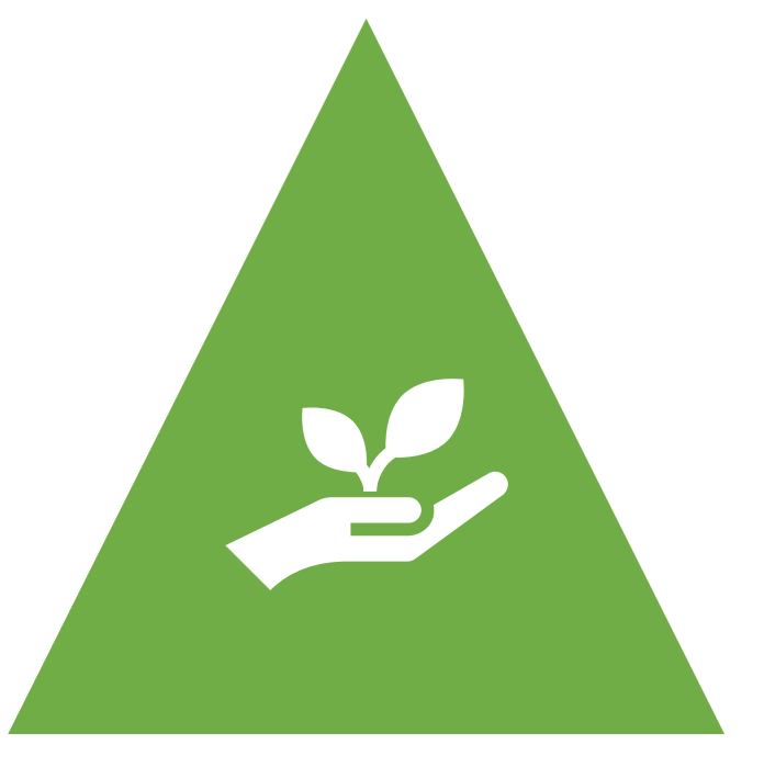
Efficient and understandable starting aid